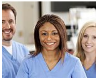
How to Get Started in Healthcare Straighterline