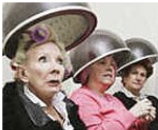
Why Stylists Hate Boxed Haircolor Hair Color For Women